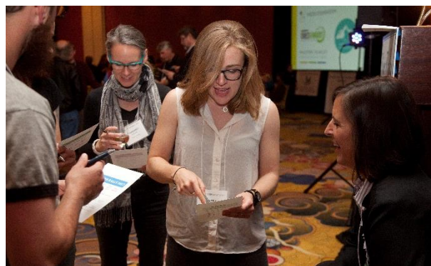
River Rally 2017 participants play Rally BINGO at the welcoming reception.