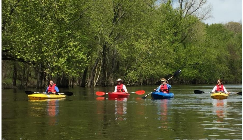
Paddling field trip.

FIELD TRIPS – Ten field trip options provided participants with more opportunities for informal networking, exploration of the region, and “off-site” education. Participants chose from multiple paddling trips on local waterways, native plant restoration and green infrastructure tours, beach cleanup at Lake Michigan, fly-fishing, and brewery tours that showcased how local breweries are implementing innovative techniques to enhance their sustainability efforts.