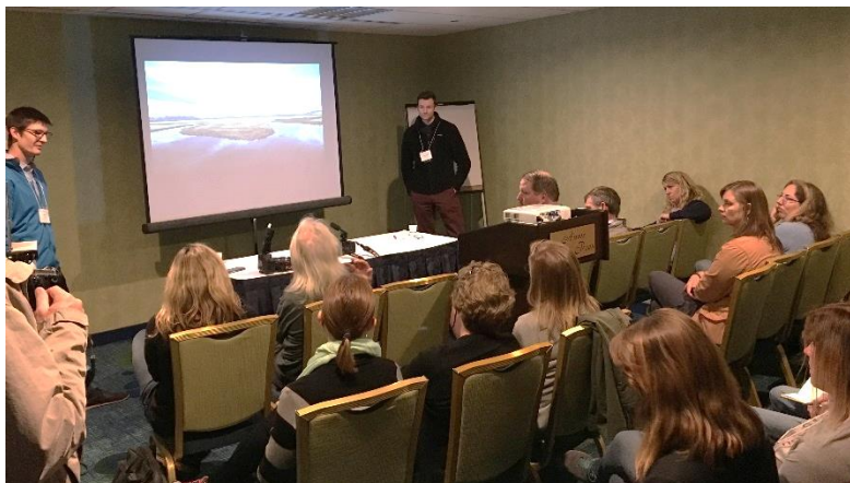
River Rally 2017 workshop sessions.