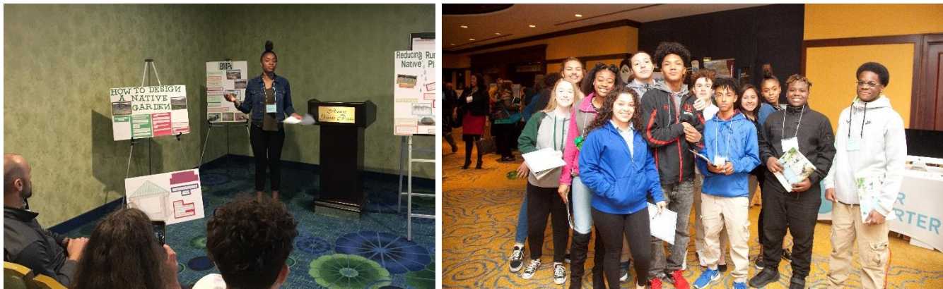
Teen River Rally students presenting in a workshop (left) and meeting exhibitors (right).

TEEN RIVER RALLY – 2017 marked the launch of Teen River Rally, a new program designed to expose local public high school students to career pathways in conservation. We welcomed 30 students and 5 teachers from C.A. Frost Environmental Science Academy and TRIO to River Rally for a day of service learning programs, workshops, and field trips. Several students presented their own work in a collaborative workshop, and all students participated in an interactive game interviewing conference exhibitors and other River Rally attendees about how they landed in their environmental careers. Afterwards, students ate lunch with Rally attendees and some visited Calvin College for a tour of campus with college students.