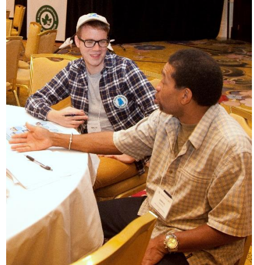
Networking at River Rally

New subject matter will be included in next year's program based on feedback from 2017 participants. Participants expressed a continued interest in sessions about diversity, equity, and inclusion, as well as interests in the Wild and Scenic Rivers Act, recreation, civic engagement, the effects of climate change, and leadership in rural communities for consideration in the 2018 program. We will continue to bring a high energy and fun event, rich in content, and brimming with opportunities to connect to others.