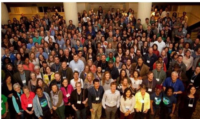
River Rally 2017 participants in Grand Rapids, Michigan.

across the country. Thank you for your part in making River Rally 2017 a great success!