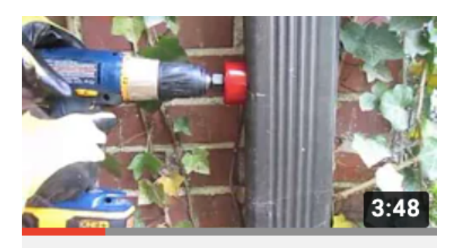
Chattahoochee River Keeper and The RainRecycle Rain...

Our friends at Coca-Cola and Chattahoochee Riverkeeper produced this brief video explaining how to construct a rain barrel. Download and watch the video prior to your workshop and consider playing it during your presentation to give attendees a quick overview of the construction process. Please note: video shows drilling into the side of the downspout. Smaller downspouts should be drilled in the front.